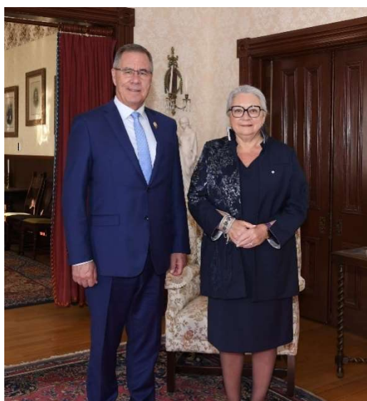
Saskatchewan Lieutenant Governor Russ Mirasty and Governor General Mary Simon

evacuation of Loyalists and British forces, transporting them to British colonies. He also realized the importance of some type of recognition, and on 9 November 1789, Lord Dorchester, declared "that it was his Wish to put the mark of Honour upon the Families who had adhered to the Unity of the Empire". As a result of Dorchester's statement, the printed militia rolls carried the notation: