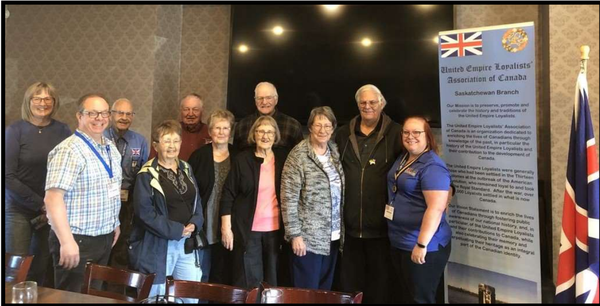
Group photo of members at our meeting in Saskatoon in September.